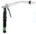
Battery Watering Gun